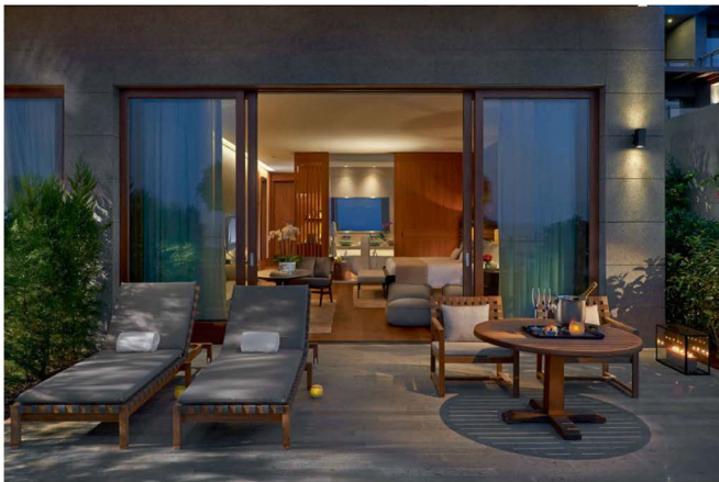
Above: Clean furniture lines combine with wooden wall panelling and floors, cream-coloured rugs and woven leather headboards, creating a serene sense of luxury while taking full advantage of the resort's outstanding vistas

be home to a fabulous luxury landmark in the Mediterranean, as it carried all the attributes of what Bodrum is famous for: eternal blue, lush green, beautiful weather and air quality. It is our loyalty to the site's nature and energy that make it the success our guests experience today."