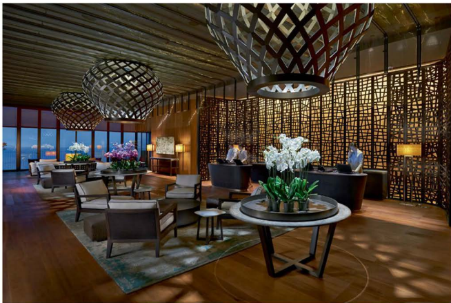
Above & Opposite: The recreation boasts custom, oversized woven light fixtures while a suspended stair leads guests to an array of indoor and outdoor public areas adorned with custom-designed furnishings and carefully selected pieces from Roda, Flexform, B&B Italia, Poliform, Kettal, Gloster, Arper and Vitra

For decades, the Mediterranean has played host to the archetypal European summer holiday with its wide range of laid-back cultures and countless resorts suiting every taste. Nightlife aficionados flock to Ibiza, romantics retreat to Santorini, gourmets delight in Corsica, and the crème-de-la-crème revel in the glamorous scene of the Côte d'Azur.