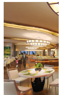
Suq, the all-day dining restaurant.

Suq, the all-day dining restaurant, has been conceived as a contemporary take on the versatile Arab food market. The entrance displays all the market stations. Here, guests can enjoy a variety of international cuisines while dining below a gently vaulted ceiling that evokes the lively open-air market experience.