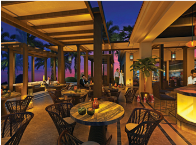
Sea Fu ... offering outdoor and indoor seating.

variety of international cuisines while dining below a gently vaulted ceiling that evokes the lively open-air market experience. Light sheer fabric and wood-paneled walls create a fresh and light ambiance. The terrace outside, with a mosaic-covered floor dotted with orange- and beige-coloured umbrellas and a pergola that offer shade to the guests.